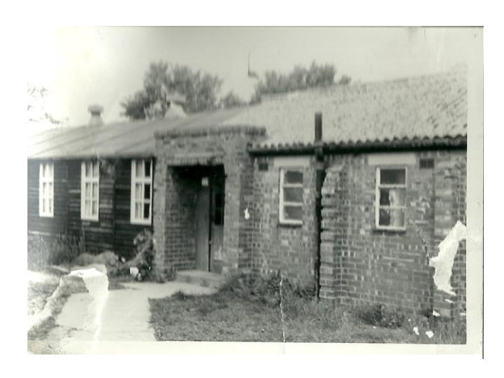
The POW Hostel

The hostel is now remembered as being a prisoner-of-war (POW) camp. It did indeed house members of the Land Army after World War II, but for most of its existence it had housed prisoners of war (POWs), firstly Italian, then German. It had been erected in 1941 at a cost of £5000. The last POW left in 1948.